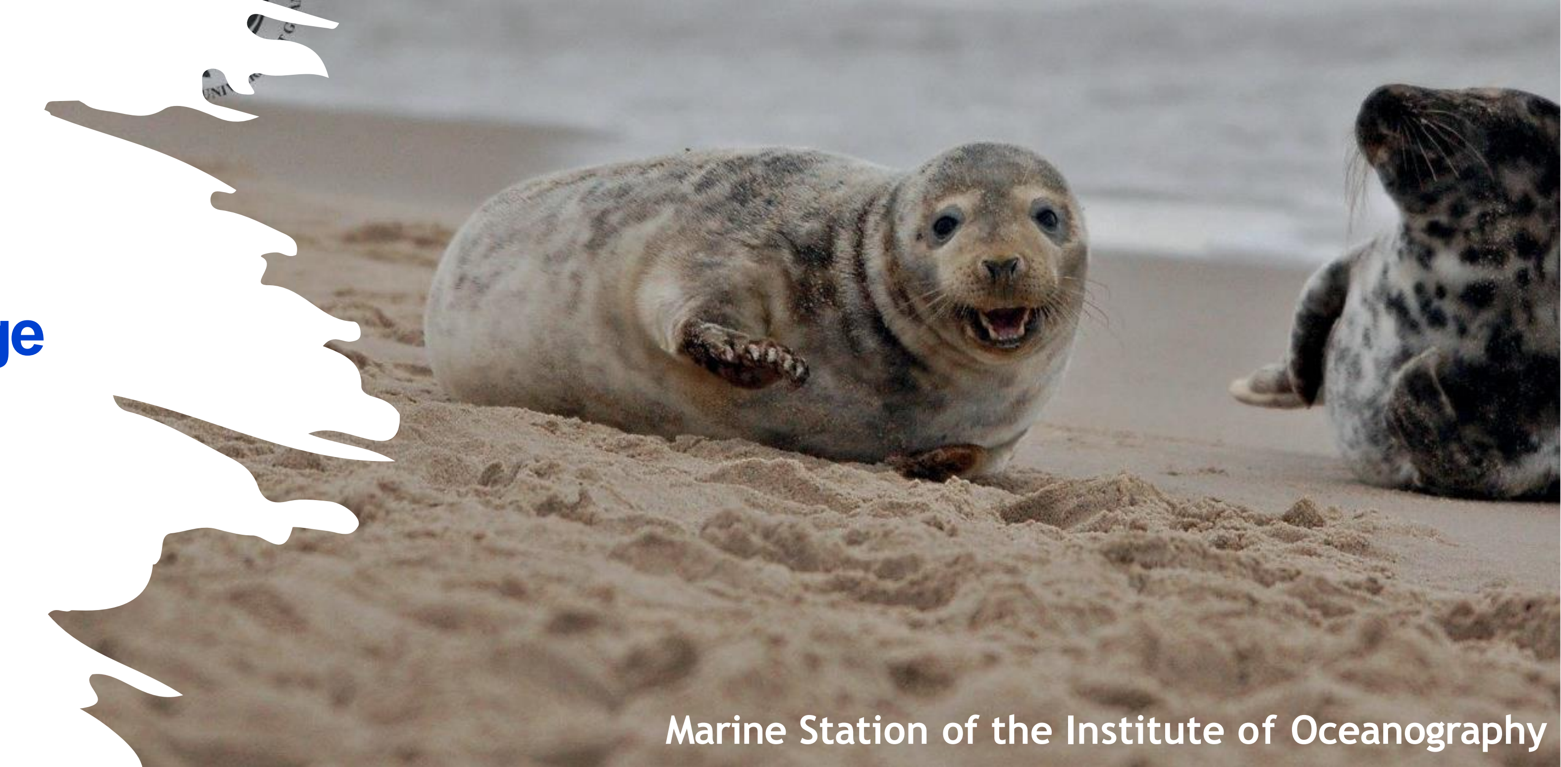
Marine Station of the Institute of Oceanography